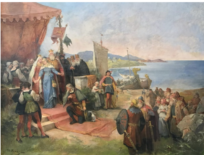
Cristina's departure to Spain, by Nils Bergslien

In the year 1257, a 23-year-old Norwegian princess left her homeland to marry in Spain. The groom was not yet selected. The princess's father, King Håkon Håkonsson (HAWK'ohn HAWK 'Ohn 'sohn) was a powerful monarch, held in high esteem by the princes of Europe. It was considered an honor that his daughter, Kristina (Kris 'TEEN 'ah), was chosen candidate for a political marriage. When the king of Spain sent representatives to Norway, offering a union between Kristina and one of the king's four brothers, King Håkon accepted. Kristina was free to decide which of the brothers she liked best. And so, furnished more splendidly than any other Norwegian princess before her, she set off for Spain in a long-ship, accompanied by a hundred distinguished men.