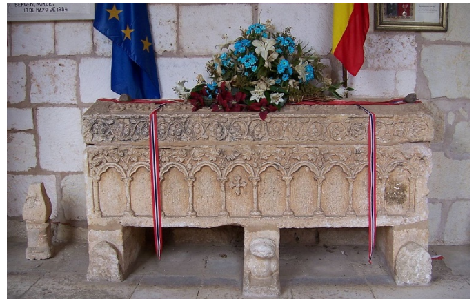
The tomb of Christina of Norway in the cloister of the collegiate church.

the king's four brothers. One of them had a harelip, said to be caused by his passion for hunting. Another brother had rebelled against his father and was out of the question as a candidate for marrying an honorable princess. The third was destined to be an archbishop and expected to live in celibacy. The fourth, Filipus, was a master of all sports and games. He was a brave man who hunted alone for wild boars and bears. The king liked Filipus best, and so did Kristina and her advisors. That settled the matter and the wedding was celebrated Sunday after Easter in 1258 with all the pomp and circumstance that the Spanish court could muster.