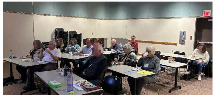
Members at February 15 presentation