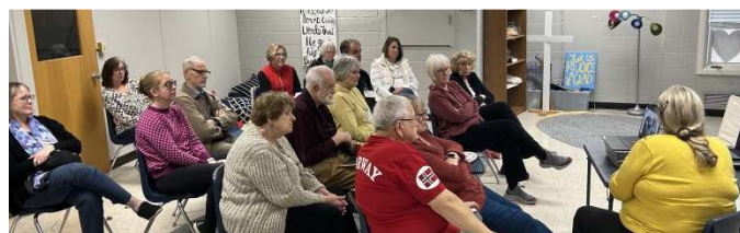
Members at the Stave Churches Presentation